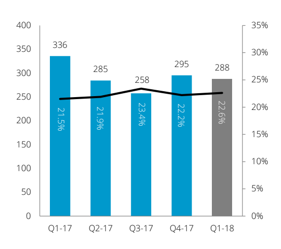
EBITDA (SEK M) / EBITDA/GP (%),